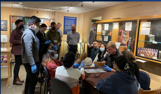
Medical students analyzing pieces from the Matson Museum collection.